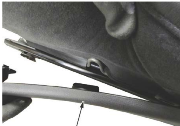
INNER RECLINING COVER

NOTE: It may be helpful to turn the seat upside down to release some of the retainers.